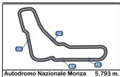
Autodromo Nazionale Monza 5.793 m.